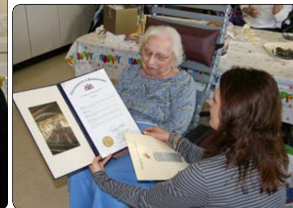
Presentation from the Commonwealth